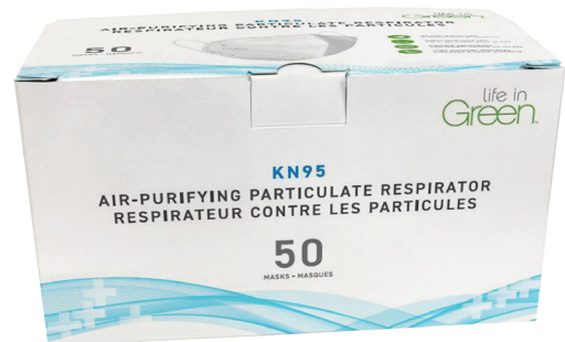
50 COUNT INNER BOX